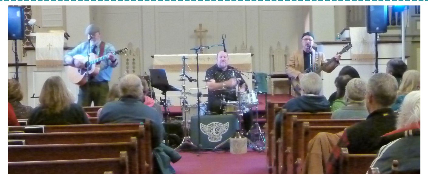
Dinner and a Show With Maine's Own Half Moon Jug Band!

This February, Parsons Memorial Library combined forces with Alfred Parish Church to give the community an awesome Valentine's Day gift - a Community Meal Fundraiser and a free concert by Maine's own Half Moon Jug Band. The show raised money to benefit the Alfred Parish Church Steeple Restoration Fund. Folks enjoyed a hearty supper followed by a fantastic show by the Half Moon Jug Band, a group that celebrates life in Maine. We hope to bring them back for another fun event in the future!